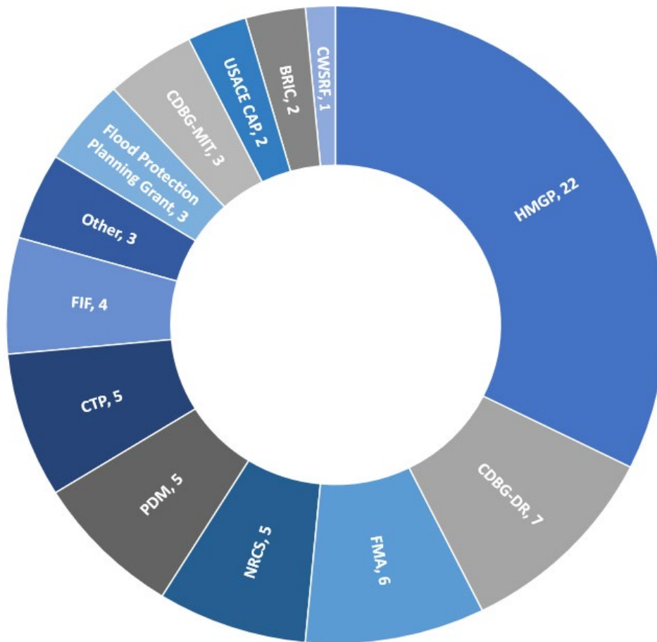
Figure 9.3: State and Federal Funding Sources Utilized by Local Communities in the Trinity Region

The TWDB's FIF is a new funding program passed by the Texas Legislature and approved by Texas voters through a constitutional amendment in 2019. The program provides financial assistance in the form of low or no interest loans and grants (cost match varies) to eligible political subdivisions for flood control, flood mitigation, and drainage projects. FIF rules allow for a wide range of FMPs, including structural and nonstructural projects, planning studies, and preparedness efforts such as flood early warning systems. After the first State Flood Plan is adopted, only projects included in the most recently adopted state plan will be eligible for funding from the FIF. FMEs, FMSs, and FMPs recommended in this regional flood plan will be included in the overall State Flood Plan, and the sponsor for a particular recommended action will be eligible to apply for this funding source. The Flood Protection Planning Grant referenced in Table 9.1 has been replaced by the FIF Category 1 planning grants.