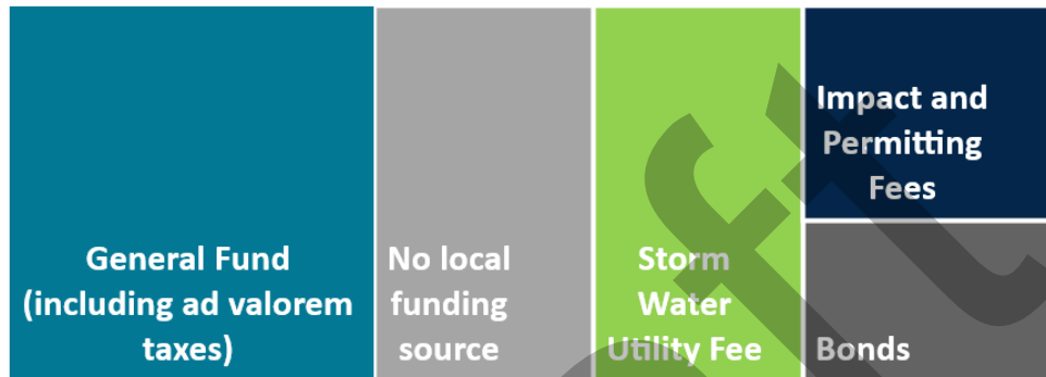
Figure 9.1: Local Funding Sources Utilized by Communities in the Trinity Region

This section primarily focuses on the funding mechanisms available to municipalities and counties, as a large majority of the FME, FMS, and FMP sponsors are these types of entities. Special purpose districts are briefly discussed as there may be opportunities to create more of these types of districts in the region. River authorities typically generate their own revenue from fees charged to users for selling water, electricity, wastewater treatment, and other services.